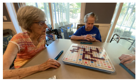
Ladies enjoying a game of Scrabble!