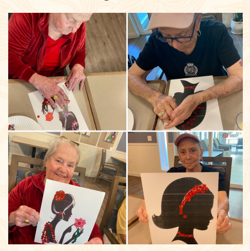
A beautiful silhouette craft