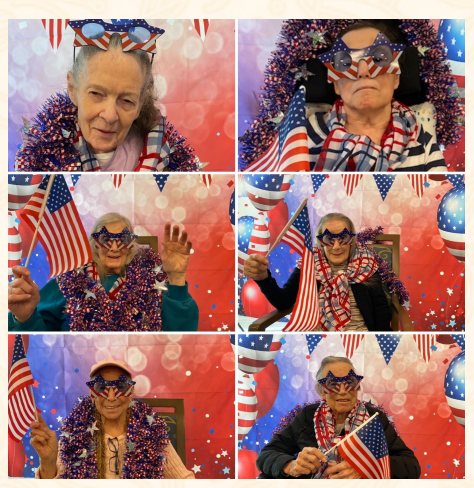
Ladies all smiles in red, white and blue