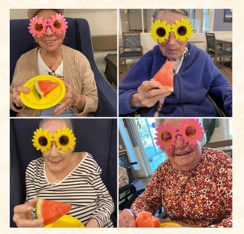
Enjoying watermelon with cute, fancy glasses