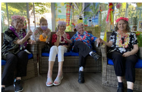
Ladies all smile with their "Oppa" love sign :)