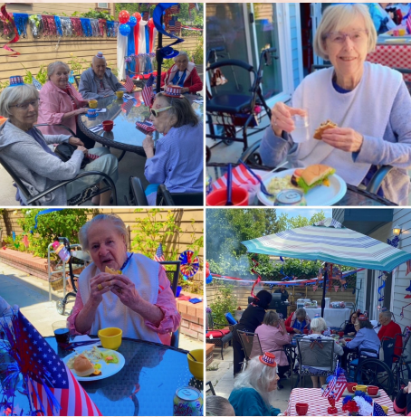
Memorial Day's backyard BBQ lunch was fun!