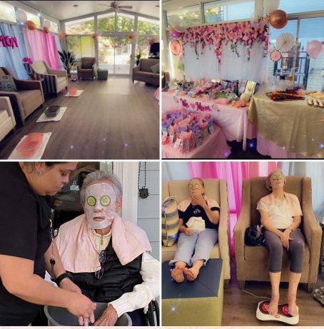
Pampering Moms on Mother's Day