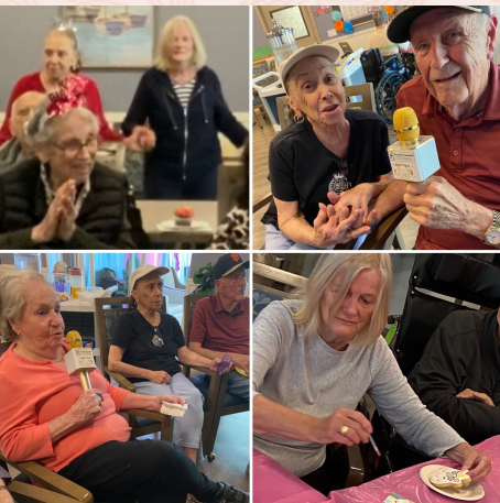
We love it when the family joins us for fun in our activities.