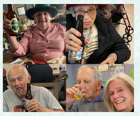
Everyone cheers to Dads with cold root beer and non-alcohol beer!